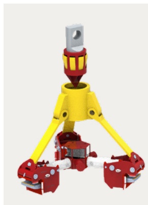
Transition piece lifting tool and socket