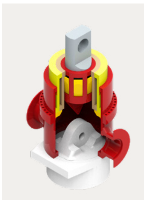
Hydrohammer and socket